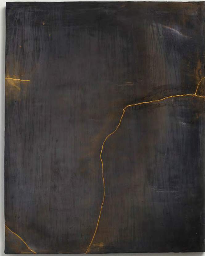
Karen Swami Triptych, 2023 Stoneware, smoke fired, waked and enhanced with Japanese vegetal lacquer and pure gold 52 x 41 cm each