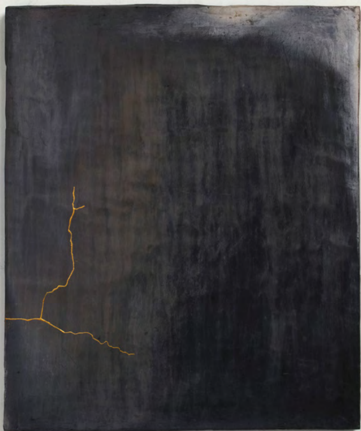
Karen Swami BR 40 , 2023 Stoneware, smoke fired, waxed and enhanced with Japanese vegetal lacquer and pure gold 46 x 39 cm