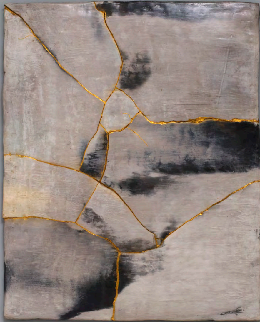
Karen Swami BR 3 , 2023 Stoneware, smoke fired, waxed and enhanced with Japanese vegetal lacquer and pure gold 94 x 76 cm